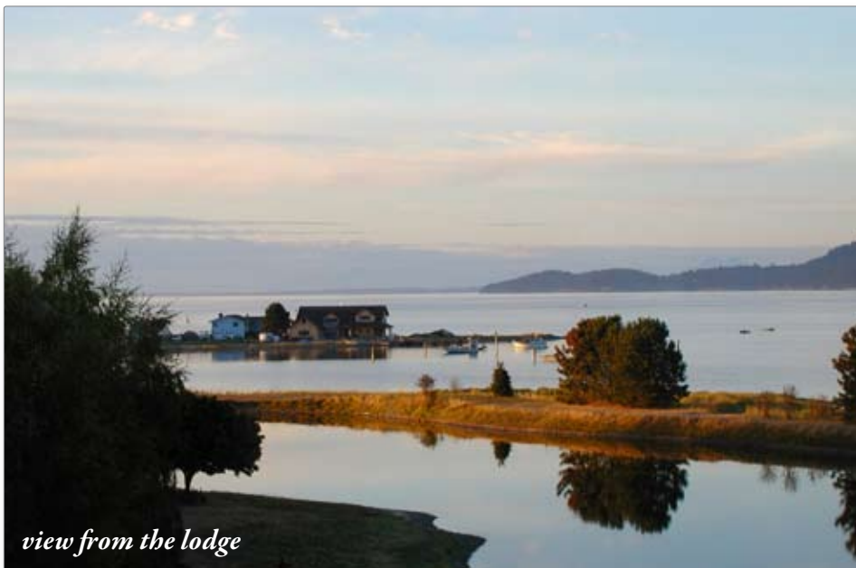
view from the lodge

A $50 non-refundable deposit is required to hold your spot. Persons with disabilities will be given priority for the new cabins. Please be prepared to share a new cabin room if necessary with another artist. If you share, this means more people can fit into the newer cabins.