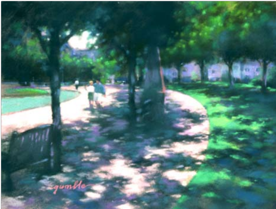
Gary Gumble - Walk in the Park