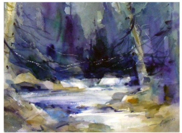
Second Place—Coralyn Jones “Little River”