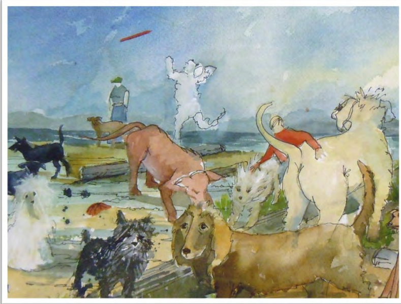
First Place - Lois Lord "Out of Africa" Collage