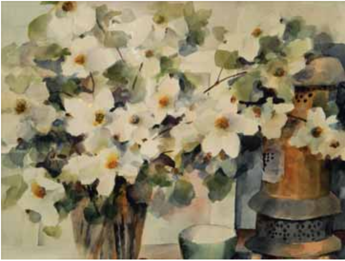
JANE BECKER: 1 st place