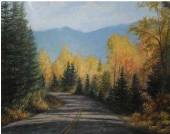
MIDORI HOSER: 3 rd place