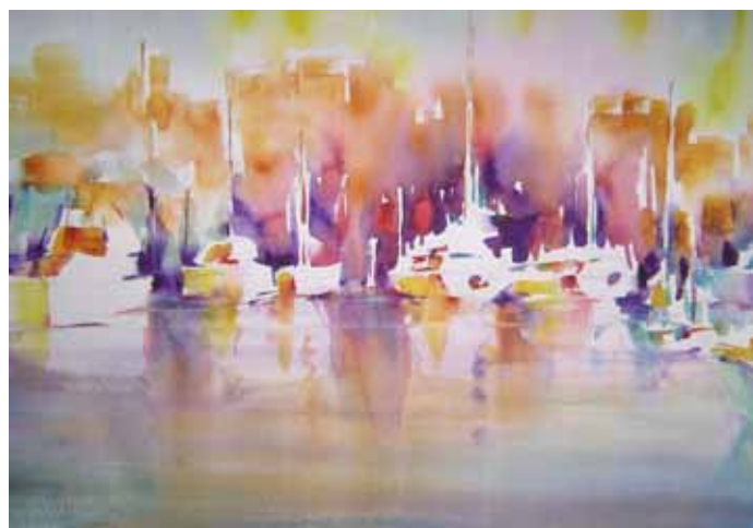
"Thin and Glittery"