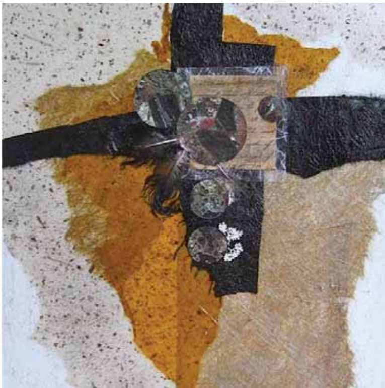
CHRIS ROMINE: 3 rd place—"Universal Rhythm"