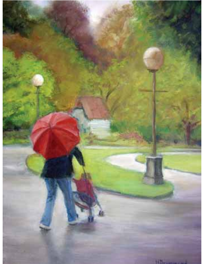
HELEN DRUMMOND: 2 nd place—"Red Umbrella"