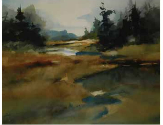
CORALYN JONES: 2 nd place