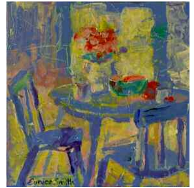
Sampling of art that was done at the workshop and brought to the October general meeting