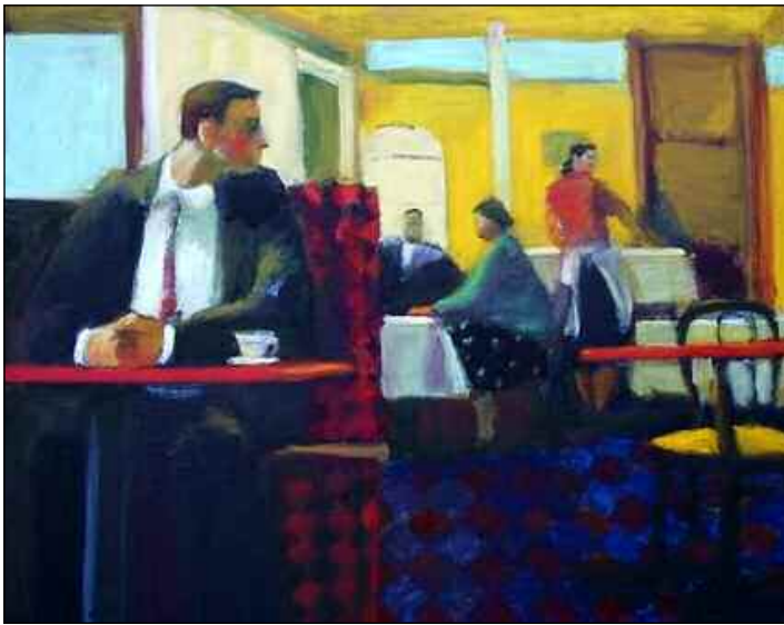
"Backward Glance" by Lois Silver